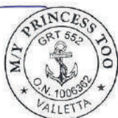
Graeme Riddle Captain MY Princess Too

PRINCESS OF THE SEA LTD. 12/13 Strait Street Valletta - VLT 1432 MALTA G.C